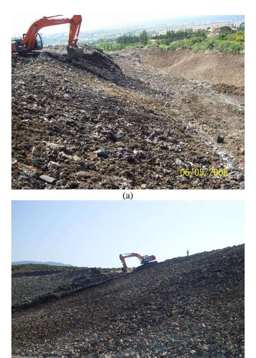
(b) Figure 6.1. Slope process of garbage

8% slope and should not exceed the upper limit. A slope process and embankment construction in an open dump site is given Fig 6.1.