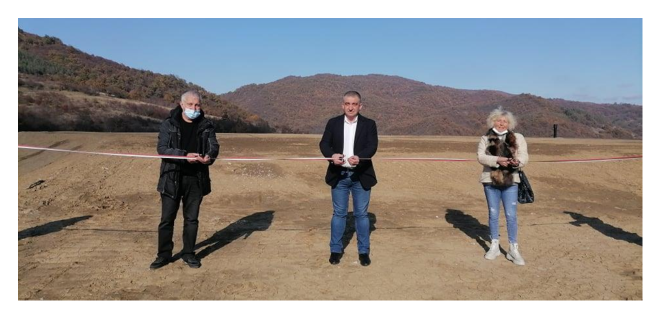
Figure 4. Official opening of the rehabilitated Elena Municipality open dump.

5. The rehabilitated open dump will be used as a green area.