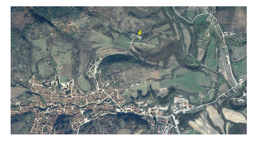
Figure 1. Elena Municipality open dump location.

Waste is deposited in an area of 24,221 m<sup>2</sup>. The area assigned for rehabilitation is 23,488 m<sup>2</sup> - sufficient to allocate the waste step-wise in compliance with the Ordinance N_{0} 6 and the instructions for conducting technical and biological rehabilitation (MEW, 2013).