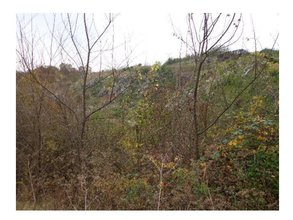
Figure 2. Elena Municipality open dump general overview. Source: <u>http://zop.elena.bg/wp-</u> <u>content-location</u>

Environmental and emission hazards imposed by the open dump can be summarized as follows: